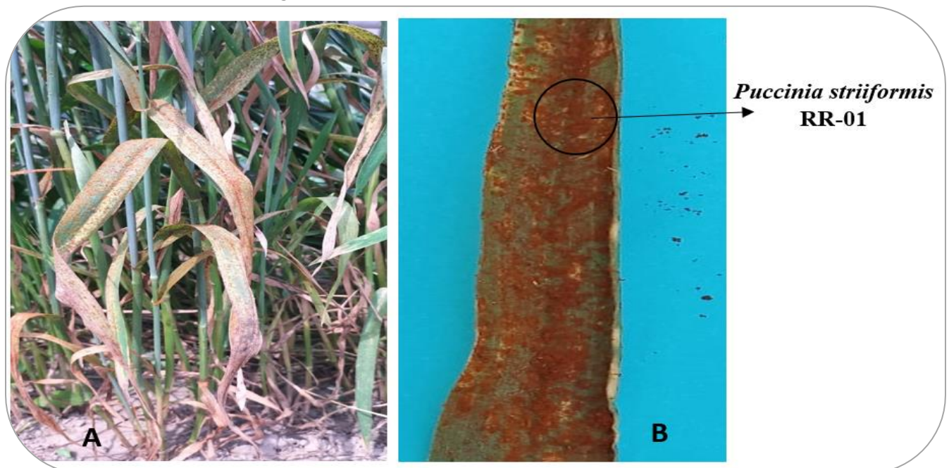
Figure 1. A presenting Wheat crop infected with P. striformis (RR-01) B presenting the severity of leaf rust.

voucher number SUB11905421. Dendrogram was prepared through Mega cluster using available data of NCBI for further confirmation (Figure 2).